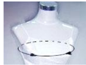
Full bust (around bust at fullest point)