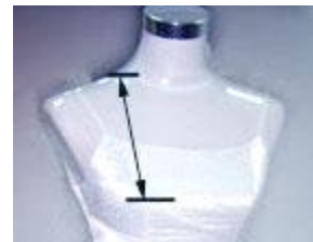
Bust front length