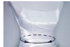
Full hip(around hips at fullest point)