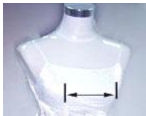
Bust to bust(bust point to bust point, or technically, nipple to nipple)