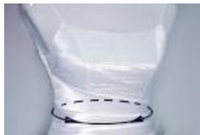
Waist length( around waist at smallest point)